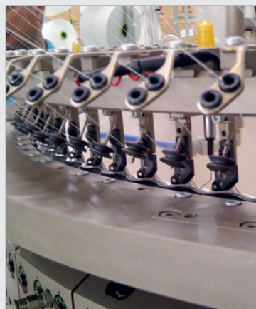
plating yarn carriers